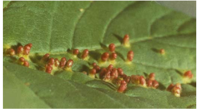
Fig. 4. Maple bladdergall mite galls. By K. Grey.

Gall-forming eriophyids cause a type of tissue “pocketing” on affected leaves in which the pocket is virtually closed, and in which abnormal growth of leaf hairs provides a protective mat for the eriophyid inhabitants. The linden gall mite, Phytoptus tillae (Past.) and the bitter cherry gall mite, P. emarginatae (k), are examples of Northwest eriophyid species, which bring about formation of closed galls on the upper leaf surfaces of their hosts. The linden mite gall is a nail type, while the cherry gall mite causes development of finger galls (Fig. 3). A bladder-like closed gall is formed in the presence of the maple bladder gall mite (Fig. 4), Vasates quadripedes Shimer. The formation of hairy patches or erinea on the underside of affected leaves constitute “open galls,” in which pocketing of tissue is nominal (Fig. 5). A typical erineum is produced by the walnut blister mite, Eriophyes erineus Nal. on the undersides of affected leaf tissue in regions of the Northwest where the host occurs.