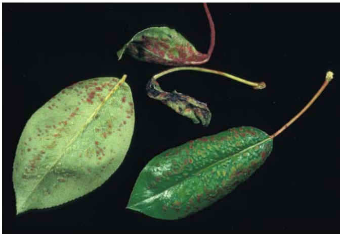
Fig. 6. Pear leaf blister mite damage.

Unlike the gall mites which pocket leaf tissue to form a protected feeding site, blister mites actually invade the leaf mesophyll, causing an internal deformity of the leaf (Fig. 5), which is expressed externally as a discolored blister. The pear leaf blister mite, Phytoptus pyri Pgst. (Fig. 6), is an important member of this group. Russeting and deformation of fruit also are ascribed to this species. A similar blister mite occurs on apples.