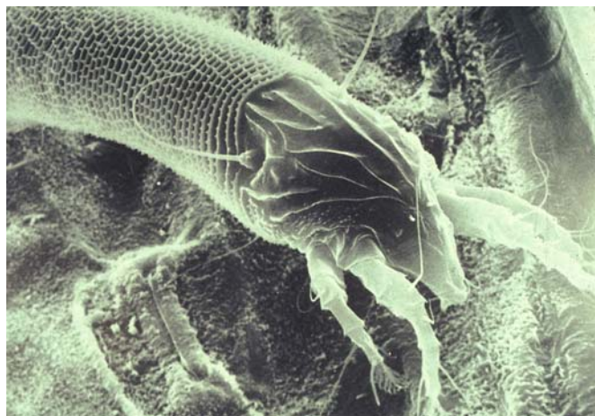
Fig. 1. An electromicrograph of an eriophyid mite.

Of the several hundred described eriophyids, relatively few are considered to be serious pests. Some species of importance in the Northwest are referred to below*, the diagnoses of symptoms which indicate their presence in the plant host. Management measures for important Northwest eriophyids are described under appropriate crop headings (see index listing under "Mites").