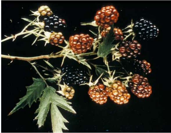
Fig. 2. Redberry mite damage on blackberry. By E.P. Breakey.